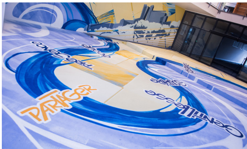
The fresco has been painted partly on the ground and the wall of the inner courtyard of Besançon hospital