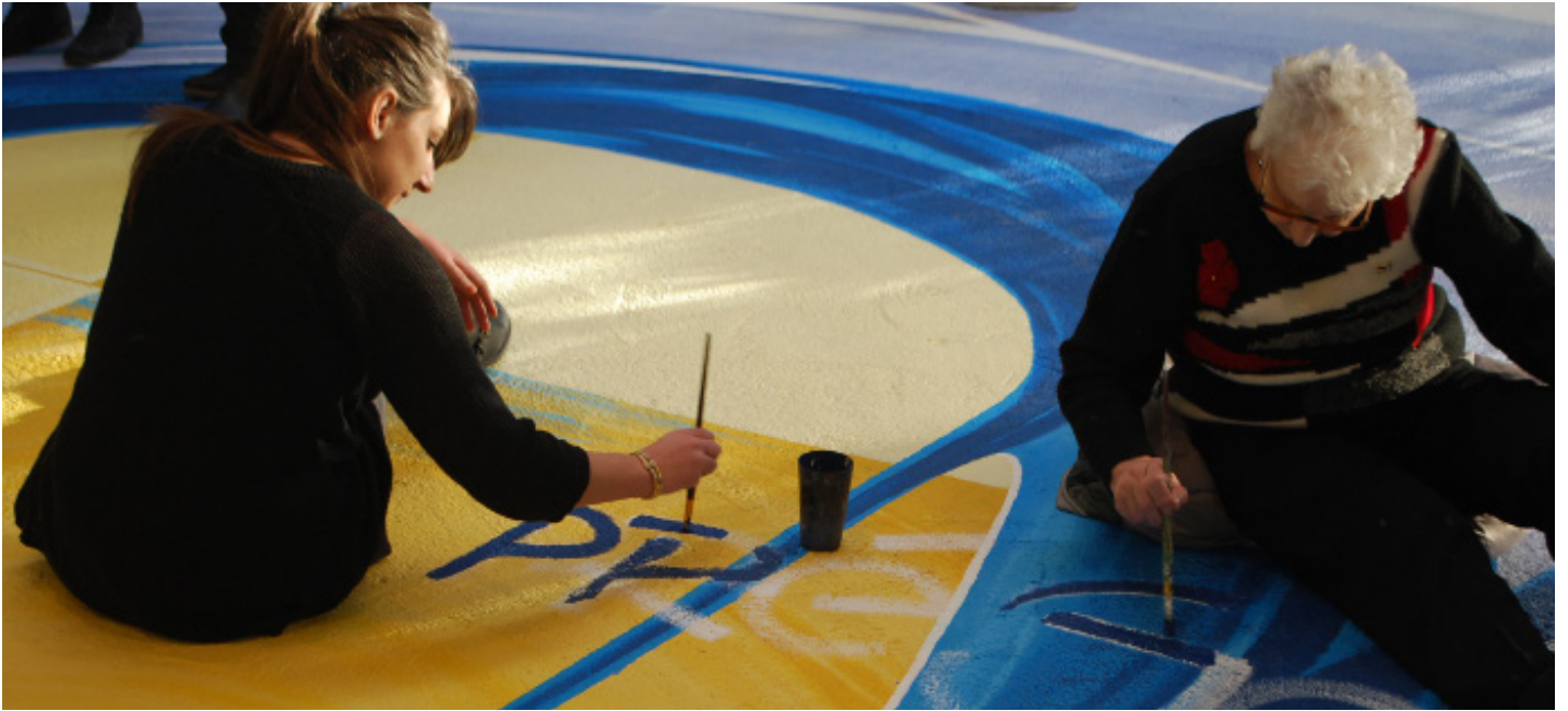
If professionals have created the attractive décor, young and elderly have painted the words

for a job. Young and elderly painted the words supervised by two street painting professionals. Within the hospital premises, the aerosols were forbidden. Acrylic paint has been used for the fresco. It has then been painted over with varnish.