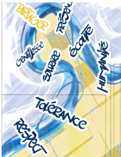
Meaning words were chosen by both elders and young

A common sense of exclusion helped bring the two groups closer together. They federated around strong and meaning words. A charter developing the strengths of a multi-generational society is born from those words. This precious document was unfortunately invisible for other inhabitants. The idea to used street painting to spread