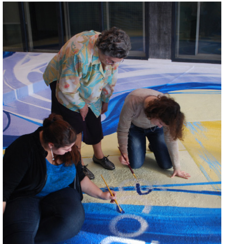
From intergenerational exchanges, young and elderly learned a lot.

The fresco has been achieved within few days. During this time frame, the young-elders relationship moved to a one-group relationship letting the solidarity appearing. The fresco was finished in 2014 and large amount of feedbacks from the hospital visitors was received. At each medical appointment, one's see the fresco. The city's aim to expose two generations to the world of one another is achieved. It has also been the case for the "guinguette" parties with the young and the meetings with Hip-Hop dancers for the elders. "Identify one's code to better understand him" is also the purpose of the film directed by the young on this fresco adventure. This project combines the draft of a charter, the creation of a fresco, making a film.