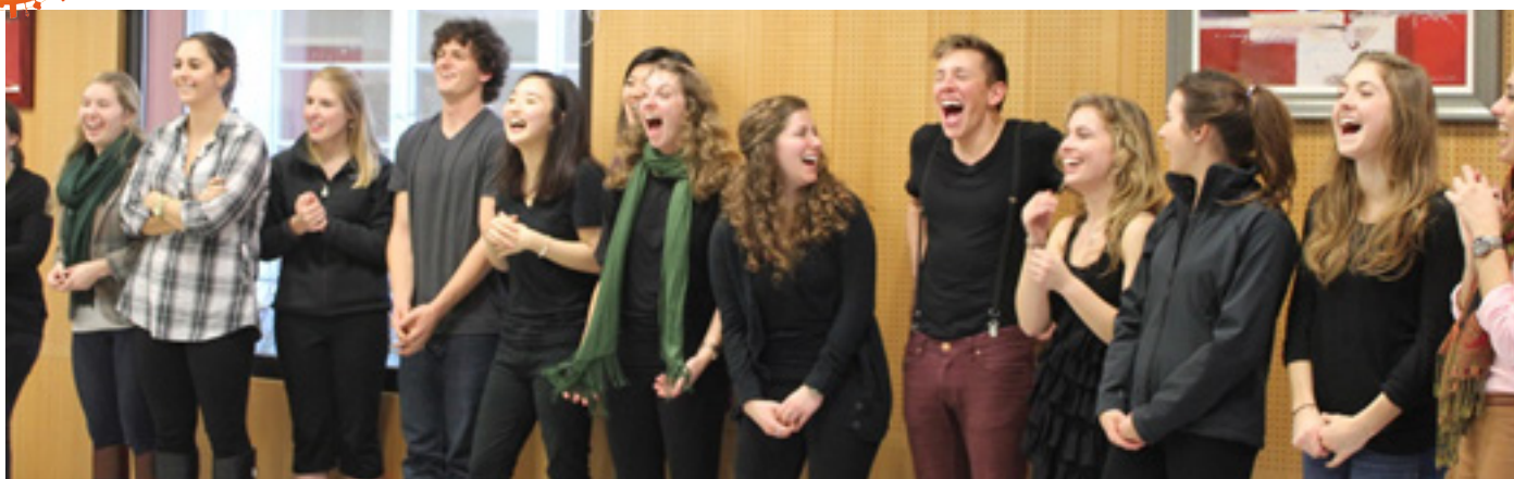
Chaque année un douzaine d'étudiants américains viennent échanger avec les résidents de l'Ehpad.

During sessions, residents and students meet to talk for one hour or more. During these sessions, a selection of literary texts made by the French teacher constitutes the basis for further exchanges between both generations. In the first instance, a student reads out the text selected. The resident has there, a role of corrector. The second part is dedicated to exchanges and experiences sharing. This second part starts with cultural questions related to the text. It is usually the occasion to share memories and stories which give some clues about French culture.